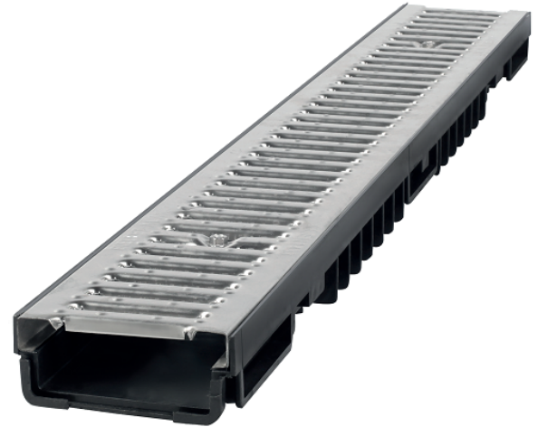
Technical sections of linear drain