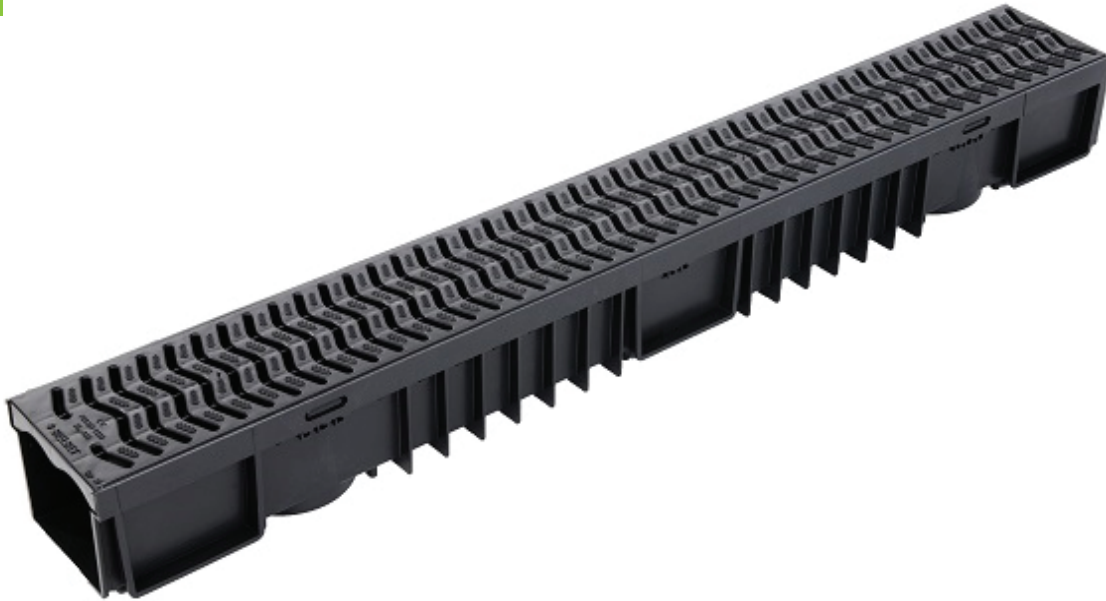
Technical sections of linear drain