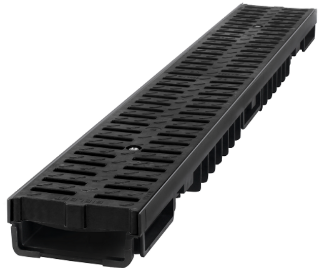
Technical sections of linear drain